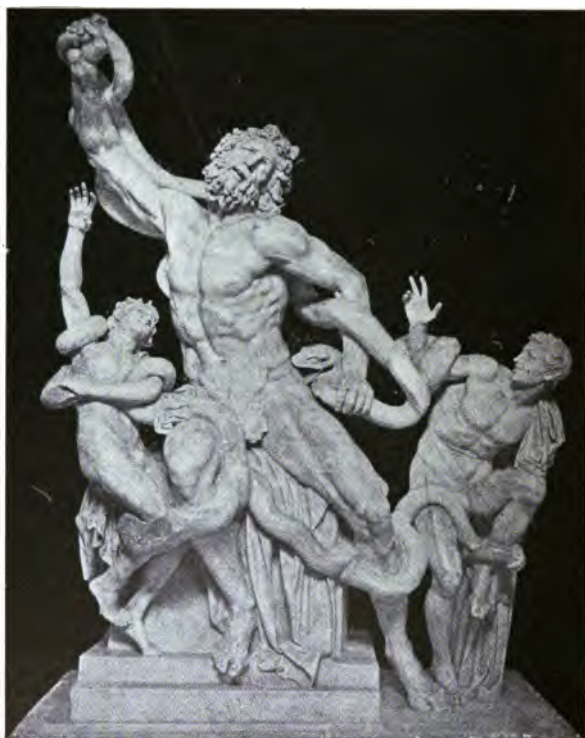
Fig. 91. Laocoon and his Sons.

of a horse was set up near the walls, and in the belly armed men, the bravest of the Greeks, were placed in ambush. Then the hosts sailed off,